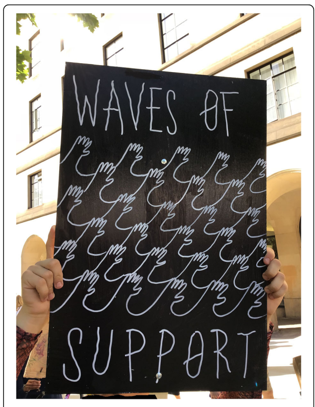
Fig. 2. Protest sign: 'WAVES OF SUPPORT'

In the previous section I explained that, through the coding process, signs coded as 'solidarity' were brought, along with 'imperatives', into the broader theme of 'don't be a part of the problem'. Drew's poster, 'WAVES OF SUPPORT', is a perfect example of the thematic relationship between solidarity and imperative. Drew intended 'WAVES OF SUPPORT' as an imperative that 'everyone needs to get involved', that 'everyone has a say'. Drew's enthusiasm for horizontal structures, and orientation towards mutual sharing and inclusion, is illustrative of what was found in the study more broadly.