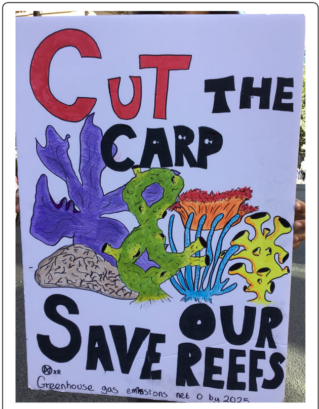
Fig. 5 Protest sign: 'CUT THE CARP & SAVE OUR REEFS Greenhouse as emissions net 0 by 2025'

While 'Save our Reefs' could be interpreted in many ways, it is one of the closer signs in the sample to a traditionally familiar form of political instrumentalist action. It includes the imperative 'save', for instance, and could conceivably be interpreted as a mainstream environmentalist demand associated with 'the preservation of wild-life and wilderness' [7]. Ade, furthermore, described reefs in a way reminiscent of Dorceta E. Taylor's concept of the 'sublime landscapes', at least in the romantic form of the wilderness evoking strong emotions. When asked what inspired the poster: