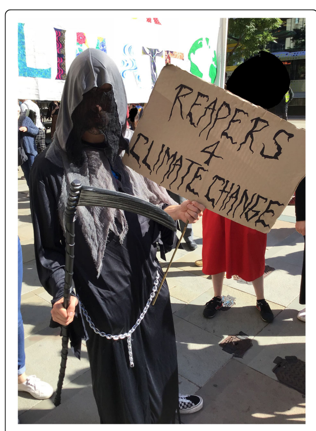
Fig. 4 Protest ensemble: 'REAPERS 4 CLIMATE CHANGE

Bowman Sustainable Earth (2020) 3:16 Page 8 of 13