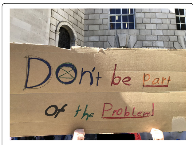
Fig. 1 Protest sign: 'Don't be part of the problem!'

I interviewed Drew, aged 16, just as the demonstration was beginning to march down the protest route. Drew explained that their sign 'WAVES OF SUPPORT' (Fig. 2) was a collaborative effort that Drew made with a friend